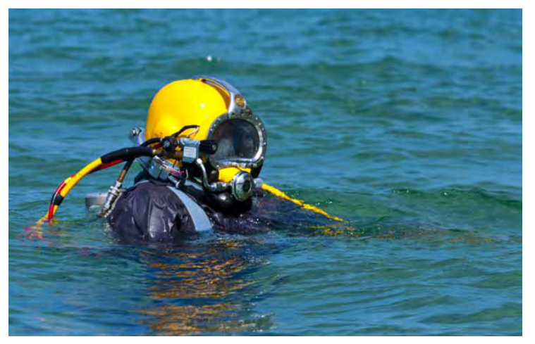
UCC Diver wearing a Kirby Morgan, Superlite 27 with a Bailout bottle.

Underwater Construction Corporation, UCC Nears 50 Years of Innovation and Job Creation continued from page 1